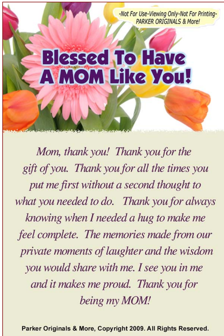
Magnet # 39 Mom, Thank You